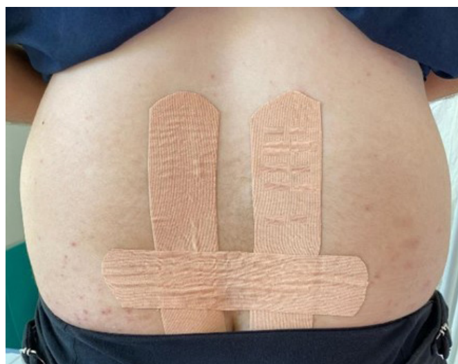
Figure 1. Kinesio taping application to the lumbar region

At the end of each treatment session, the patients in KTG applied KT with a 5 cm × 5 m kinesio tape material using a special 'muscle technique'. 3 The patient who was standing was asked to bend forward. The lower end of the tape was first applied 7 cm below the sacroiliac joint at the level of the paravertebral muscles, then the patient was asked to make a slight rotation to the left, and in this position, the tape was applied upwards on the paravertebral muscles without any tension. When taping the left paravertebral region, the same procedure was performed in reverse as on the right, and the tape was not stretched. The third tape was applied to the patient, who was standing upright and leaning slightly forward, with the tape stretched by 25%, passing over the sacroiliac joints and parallel to the ground. When the patients were in upright posture, folds formed on the bands. It was observed that the folds were compatible with the patient's body movements and remained until the day the bands were removed (Figure 1). 3 The tapes usually remained on the patient's body until the patient came for the next taping. When the patients came to each treatment session, the previous tape was removed from the skin by the physiotherapist, and the taping was reapplied. No itching, redness, or allergic reactions were observed in any patient.