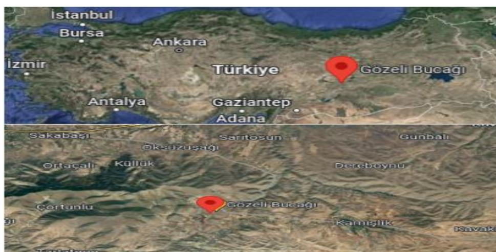
Figure 1. Distribution areas of plants and the region where they are collected in Turkey

Verbascum diversifolium Hochst., Alcea calvertii Boiss. species were collected from the roadside of the Gözeli plain during the flowering period of the plants. The region where it was collected is shown in Figure 1. The above-ground parts of the collected plant materials were dried in the shade. The aerial parts of the dried plant samples were extracted with a soxlet device using ethanol as a solvent [21]. Extraction was continued until the final extract was colorless. The ethanol content of the extracts obtained from the Soxlet device was removed in the evaporator and the dry extracts formed were stored at +4 °C.