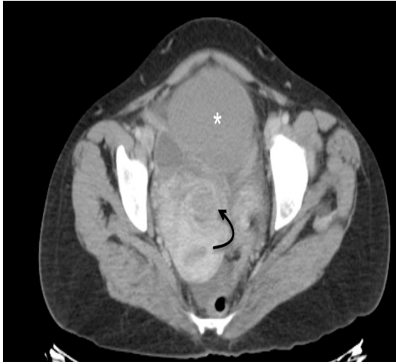
Fig. 1. Axial contrast-enhanced CT scan of the pelvis shows a giant mass with no contrast enhancement (*) and swirl-like rotation in the uterus (curved black arrow). Also, a displaced round ligament is seen (black dashed arrows).

intravenous contrast-enhanced abdominal CT was performed. A giant mass with no contrast enhancement was observed in the anterior part of the uterine fundus and swirl-like rotation in the ligamentous structures of the uterus was observed on CT (Fig.1). As a preliminary diagnosis, uterine pedunculated myoma torsion and accompanying uterine or adnexal torsion were suspected. To evaluate the ligamentous structures and to confirm the diagnosis, the patient underwent contrast-enhanced MRI of the lower abdomen. MRI showed a soft tissue lesion in adjacent to the uterine fundus and the lesion was hypointense on both T1- and T2-weighted images and there was no contrast enhancement in lesion. In addition, MRI showed a swirl-like rotation in the uterus and uterine ligamentous structures. Also, there was malposition of uterine ligaments (Fig. 2 and 3).