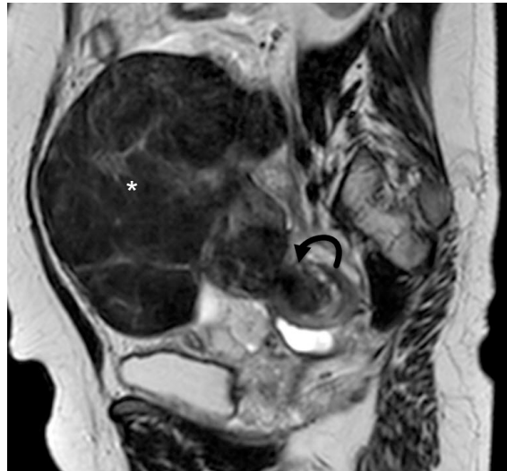
Fig. 3. Sagittal T2-weighted MRI of the pelvis shows a giant hypointense mass and swirl-like rotation in the uterus (curved black arrow).