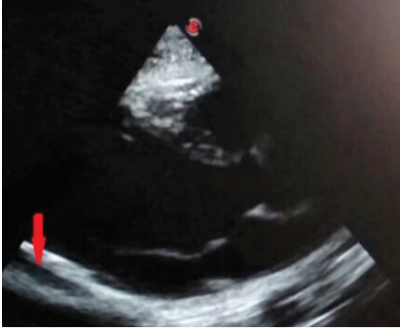
Figure 1. Echocardiography showing pericardial effusion in the posterior left ventricle and increased pericardial brightness