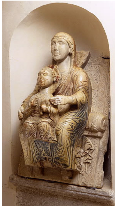
Figure 3. The Blessed Virgin with Christ,

While the forgery interventions are visible in the upper part of the door inside the church, as well as the statue of the Blessed Virgin with Christ in her lap kidnapped by the Catholic church of St. Peter in Trepça, which they present as having been taken from the monastery of Banjska enough to lose track.