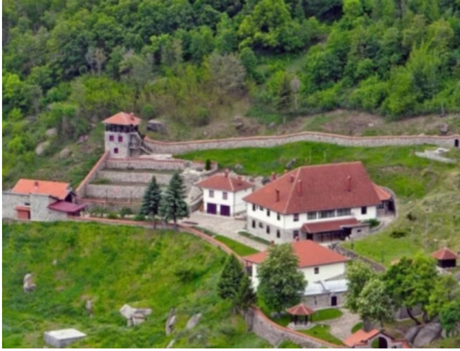
Figure 2. The church was forged and turned into a monastery

While the forgery interventions are visible in the upper part of the door inside the church, as well as the statue of the Blessed Virgin with Christ in her lap kidnapped by the Catholic church of St. Peter in Trepça, which they present as having been taken from the monastery of Banjska enough to lose track.