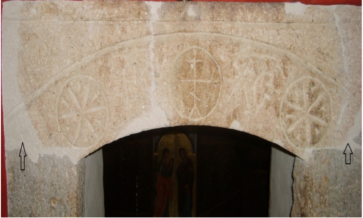
Figure 4. The door where counterfeiting interventions are noticed.

sculpture taken from the church of St. Peter in Trepça