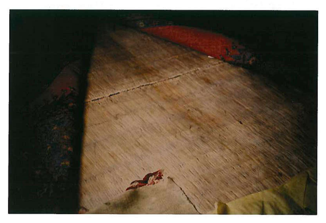
Fig 6: A similar sea club-rush matting is also placed between the wool carpets and the floors in houses.