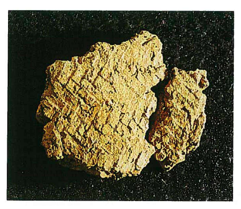
Fig 5: A mat impression from Çayönü Neolithic site, Diyarbakır (Özdoğan And Başgelen 1999: 29).