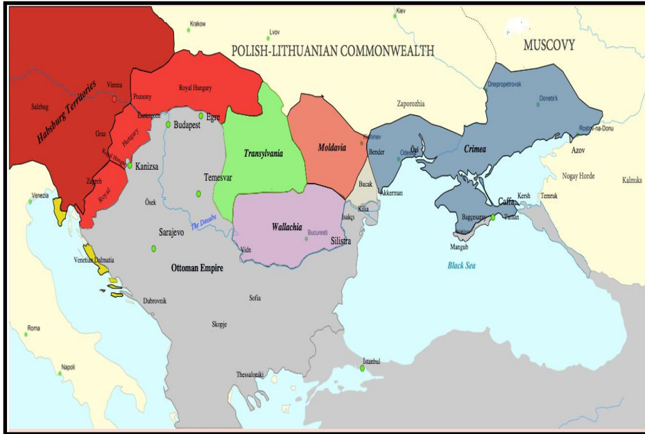
Map 1: Ottoman Provinces and Tributaries in Europe

troops on the Ottoman side of the Habsburg-Ottoman frontier was about 30.000.