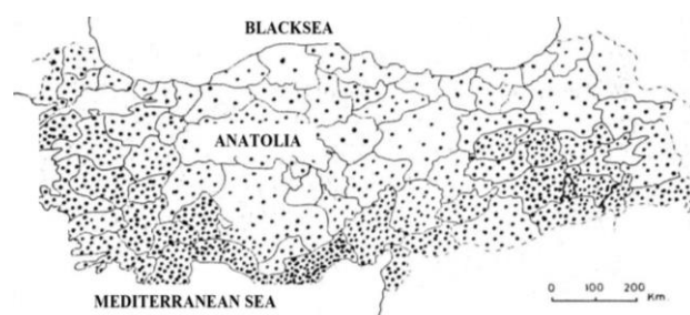
Figure 1. Distributions of the pure hair goat ( Capra hircus L.) in Turkey (Bekiroğlu and Tolunay, 2010).

abandon the production system of pure hair goat owning villagers. Therefore, conflicts and hostilities occurred between the forest administration and the forest villagers who bred goats. This big dilemma affected sustainable goat breeding negatively. Goat producers did not have any other alternatives for their subsistence. Some of the villagers did not give up the production in forest areas, even though it was forbidden by the regulations (Darcan et al. 2005). Especially, grazing in forest area and protected areas was prohibited by forestry registrations such as Action Plan for Reducing Goat Damage prepared by GDF. Thus, livestock (especially nomadic livestock) production decreased in many districts (Alkan and Korkmaz, 2009). Alkan and Ugur (2015) reported that various prohibitions and limitations for grazing in forest area affected views and perceptions of livestock breeders negatively. In addition, not uniting the goat breeders under an organization causes negative situation.