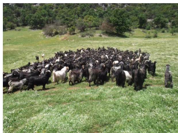
Figure 2. A flock of pure hair goat in Mediterranean Region of Turkey