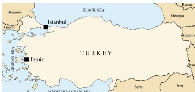
Figure 1. The study area

Two developed cities in Turkey were selected as the study area to conduct this study, İstanbul and İzmir (Figure 1).