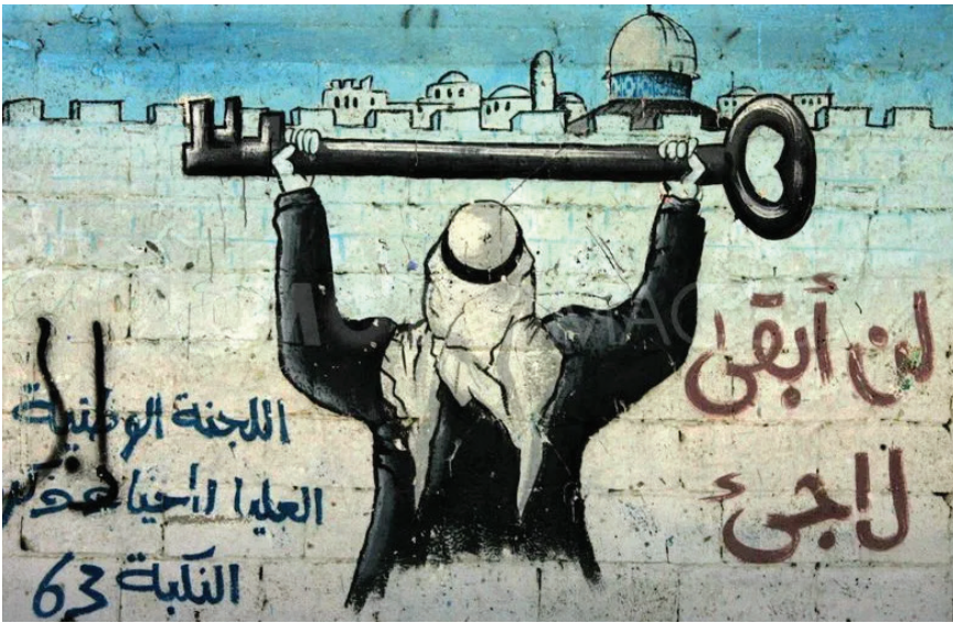
Figure-5: A mural bearing the key symbol

of creating meaningful representations with a constellation of symbols associated with Jewish tradition. For example, Yaakov Stark's mural known as "the First Monumental Zionist Work of Art", located in Jerusalem's Aodes Synagogue, served as a source of inspiration for "Zionism's visual language", since it is laden with historically meaningful signs and symbols such as "the Hebrew letters, the Star of David, the menorah, the flora of the land of Israel, the symbols of the Israelite tribes [and] the zodiac." 46 Of these symbols, the Star of David and the menorah became the emblems of the new nation and Jewish sovereignty respectively. 47 Stark's mural was followed by other artworks that contained a "repertoire of emblematic, idyllic and often non-specific images of the country as produced by Jewish artists in Palestine during the 1920s." 48 Attempts at constructing meaningful illustrations contributed to the constitution of the symbolic foundation of the soon to be established State of Israel.