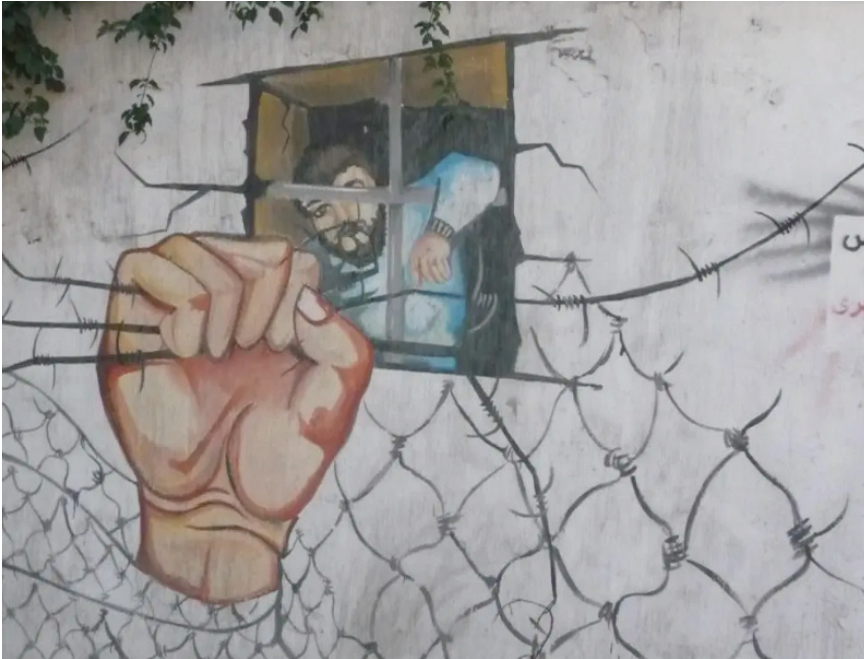
Figure-3: A hand on barbed wire image from Gaza

The Palestinian street art scene also features murals that depict the resisting Palestinian subject in the form of using a slingshot, burning tires or making a V-sign. Portraying these acts in a graffiti form, Figure-2 provides a powerful snapshot of Palestinian defiance and evidently conveys the message that circumstances necessitate resistance. As the acts depicted in Figure-2 represent gestures of resistance that are deeply rooted in the Palestinian struggle, such graffiti works also serve to refresh memories of liberation struggle.