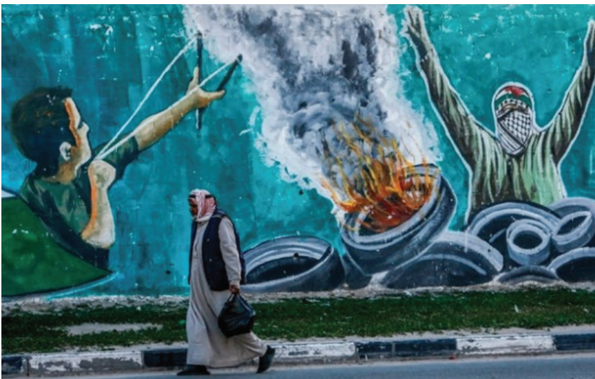
Figure-2: A mural depicting a resistance scene in Palestine

Despite such unfavorable developments, Palestinians have proven resilient in their determination to continue resistance, for which street art has been an essential instrument. Palestinian visual acts involve attempts to undermine occupation by painting murals suffused with symbolically powerful images in public space. One of the most expressive graffiti images sketched on the walls in Palestine is a well-known image of the Palestinian militant Leila Khaled. Khaled is known as a “heroine and iconic figure” 39 in Palestinian tradition of resistance. To counter Israel’s attempts to portray Palestinian popular figures as terrorists, Palestinians have popularized one of Khaled’s most remarkable images in their graffiti works. Khaled’s image in Figure-1 indicates a facial expression that exudes hope and optimism and also “rejects the terrorist label.” 40 Although her smiling face can be construed as a sign of hope aimed for Palestinians, the image does not omit her militant self, which is signified by the keffiyeh and gun and is clearly aimed at Israel.