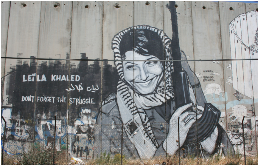
Figure-1: A mural of Leila Khaled on the Separation Wall

In occupied Palestine, Israel has sought to achieve its cognitive imperialist objectives through "a visual language that was used to blur the facts of occupation and sustain territorial claims of expansion." 36 The growth of Israeli settlements in the West Bank has been accomplished through the visual transformation of the territorial landscape, which required projecting the settlements as "organic parts" of Israeli territories. 37 The policy of designing the landscape based on the goal of expanding Israeli settlements led to the deterioration of Palestinian life, which is evident in the transition from occupation to cantonization and finally to separation. 38