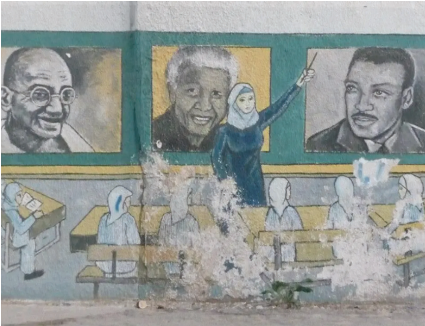
Figure-11: A Palestinian mural bearing the images of Mahatma Gandhi, Nelson Mandela and Martin Luther King

and Trump and the Palestinian cause.” 83 As a result of such graffiti pictures, sites such as the Separation Wall “risks becoming a street art gallery rather than actually politicising what it is about”, as put by a British tourist visiting the site. 84