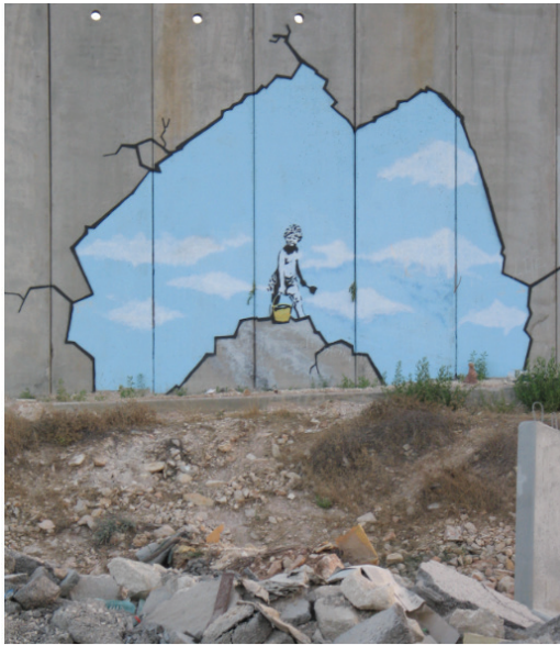
Figure-8: A Banksy mural on the Separation Wall

opportunity to show their solidarity with Palestinians. Of all the foreign artists appearing in the Palestinian street art scene, British street artist Banksy merits special emphasis, as his aesthetic murals on the Separation Wall have attracted considerable international attention due to wide press coverage. 70 Despite the international spotlight afforded to Banksy's works, they did not always resonate well with the local population, with some expressing their displeasure at "his aestheticization of their suffering." 71