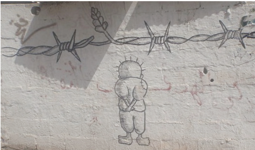
Figure-6: The Handala image

Given this background, Palestinians' attempts to build their own visual vocabulary must be viewed as an endeavor that is aimed at undermining Zionism's political imagination. Indeed, visual and textual elements populating Palestinian settings carry strong political overtones such that they reflect a determination to assert the Palestinian subject's political existence in connection with the broad goal of establishing a sovereign Palestinian statehood. Visual messages designed to convey Palestinian aspirations primarily stress Palestinians' dedication to recover their inherent rights over the historic land of Palestine. This is revealingly demonstrated by the key symbol. As well as signifying Palestinian uprootedness, this symbol is also representative of Palestinians' determination to acquire the right of return. As the right of return has been one of the most contentious issues between the Israeli and Palestinian sides, through their consistent use of the key symbol in their visuals, Palestinians continue to remind Israel that they remain steadfast in their commitment to reclaiming their land.