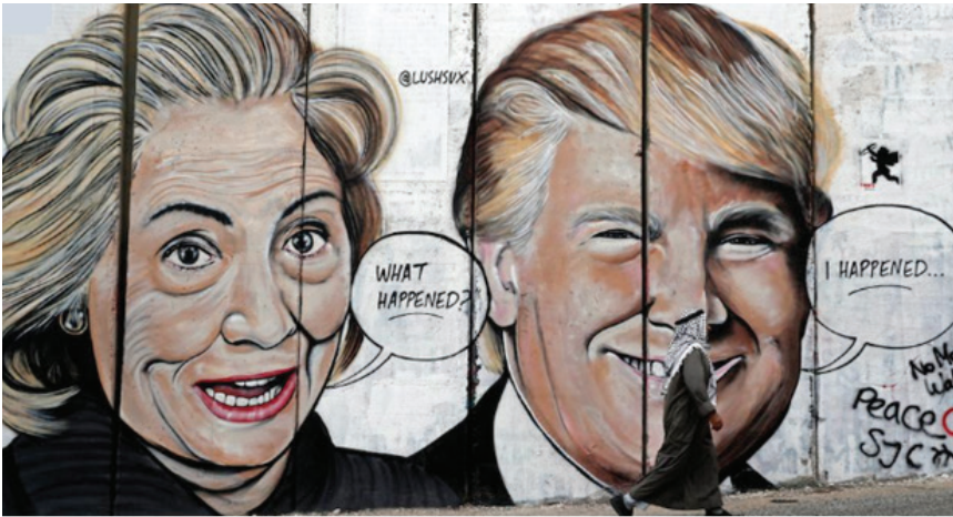
Figure-10: A mural painted by Lushsux on the Separation Wall