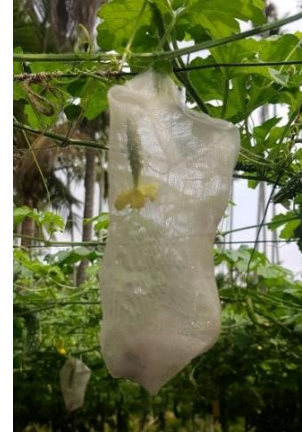
Figure 1: Sleeve cage

performed at P=0.05 levels of significance. All other calculations are performed using the MS Excel.