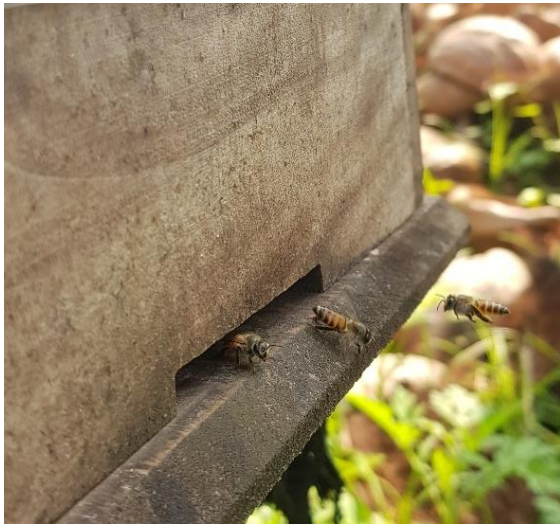
(a) Incoming nectar forager and outgoing bees