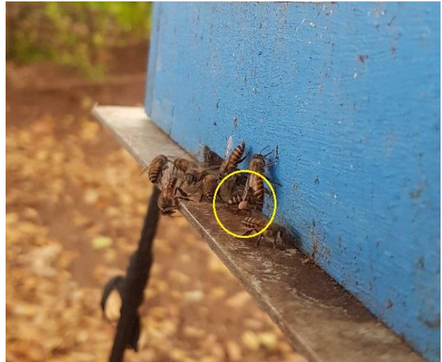
(b) Incoming forager with pollen load in corbicula