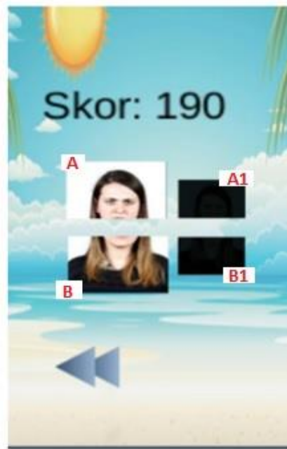
Figure 7. Puzzle Screen

Figure 8 shows two or three selection screen when the user selects the training screen. On this screen are pictures of happy, unhappy, angry and scared feelings. When the correct selection is made, the star figure is placed on the screen and the score information is displayed on the screen. When the three stars are completed, the transition to the next emotional state is made.