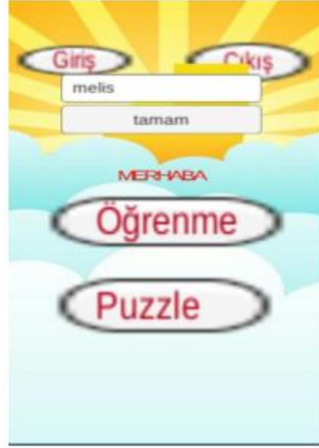
Figure 4. Login Screen

Interfaces on the Game Screen As shown in Figure 4, user information is recorded on the registration screen and recorded in the database. First of all, name-surname is taken from the text field and this information is kept in the game. The score and level information obtained after the end of the game is presented to the user and registration is performed.