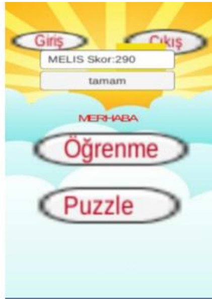
Figure 5. Score Display Screen