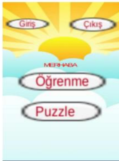
Figure 6. Section Selection Screen

If the game's puzzle option is selected, a screen as in Figure 7 is presented to the user. On this screen, the user is expected to place the pieces of the puzzle in the correct places. For example, in Figure 7, part A must be placed on part A1 and part B on part B1. Incorrect positioning is prevented and orientation is made for the user to do the right thing.