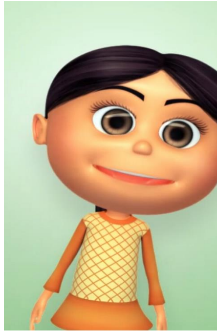
Figure 10. Video Training Screen