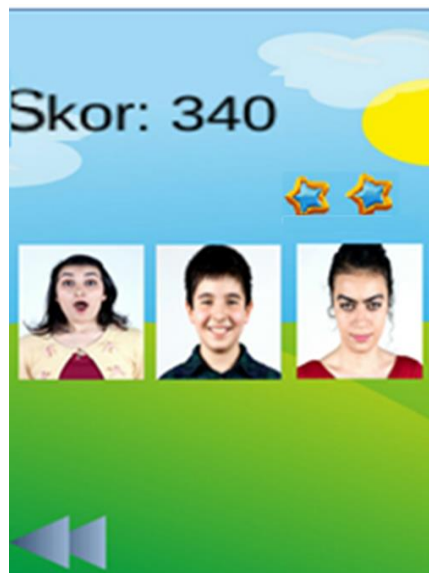
Figure 8. Training Screen

Figure 8 shows two or three selection screen when the user selects the training screen. On this screen are pictures of happy, unhappy, angry and scared feelings. When the correct selection is made, the star figure is placed on the screen and the score information is displayed on the screen. When the three stars are completed, the transition to the next emotional state is made.