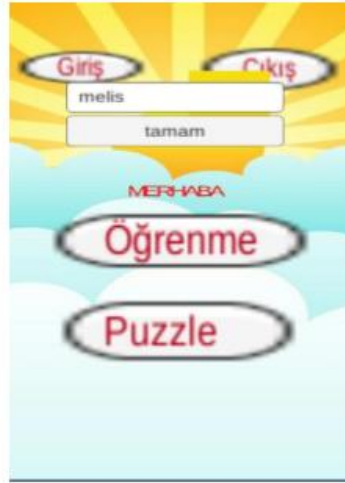
Figure 9. Level Selection Screen

Whichever option is selected in the rating, the user is presented with a pop-up screen as in Figure 9. If the user is a new user, this screen will not open. In this case, the user name is checked in the database. If you are a registered user, this pop-up screen will appear, telling you whether or not to load the level information you last played in the related game. No button indicates that the game will start from the beginning. When the user presses the yes button, it is ensured that it continues from where it was left.