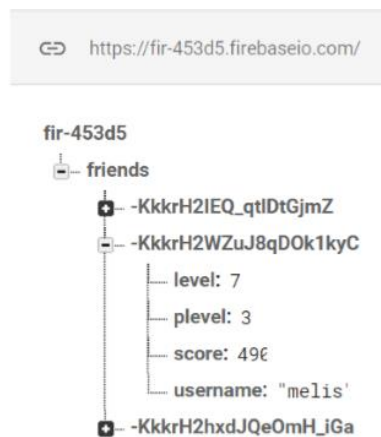
Figure 1. Adding A Sample Record To The Firebase Database