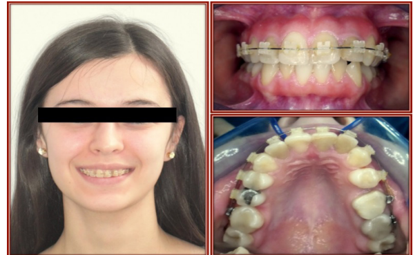
Figure 2 Case Photos (Before)

orthodontic treatment. In this case the physician whom started the orthodontic treatment, was began without taking into account procedures. Patient had periodontal problems and gingival index scores were measured close to 2 because of poor oral hygiene at first arrival. Furthermore, she had discoloration both as existing root canal treatments and as deformed previous restorations. All under these terms, the treatment plan was determined by a multidisciplinary approach.