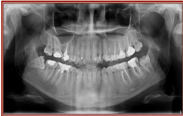
Figure 1 OPG Before Orthodontic Treatment

Initial case procedures were started when the patient came for the first appointment in faculty clinics. For the assessment of this case; radiographs, photographs and the study cast models were taken. The transverse positions of the maxillary and mandibular midlines were evaluated in postero-anterior cephalogram. There was no skeletal discrepancy between the jaws and it was found that the midline shift was caused from dental asymmetry. Thus, we thought that her previous orthodontist had reached the same conclusion and had chosen the tooth extraction treatment. Before the orthodontic treatment, solving other dental problems is important for oral hygiene recovery. Because it will become so difficult for patient to maintain oral hygiene during the