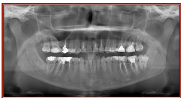
Figure 3 OPG After Orthodontic Treatment

Over a period of 15 months, orthodontic treatment was completed. On the right side Class I molar occlusion and on the left side full cusp Class II molar occlusion with a Class I canine relationship and 2 mm overjet and overbite for both sides were obtained (Fig 3).