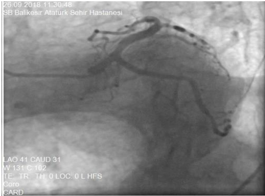
Figure 2. Anteroposterior caudal projection of circumflex and left anterior desendan artery