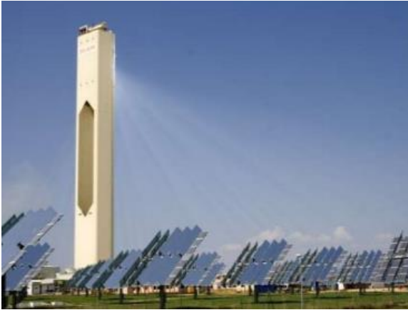
Figure 2. Tower System Application

Sun radiation stays focused on a receiver on the top of tower as many large-scaled mirrors are used in a power tower. A heat in receiver is used to produce electric on a traditional turbine-generator by heating as to produce transfer-flow stream. Sample Tower system application is indicated on Figure 2.