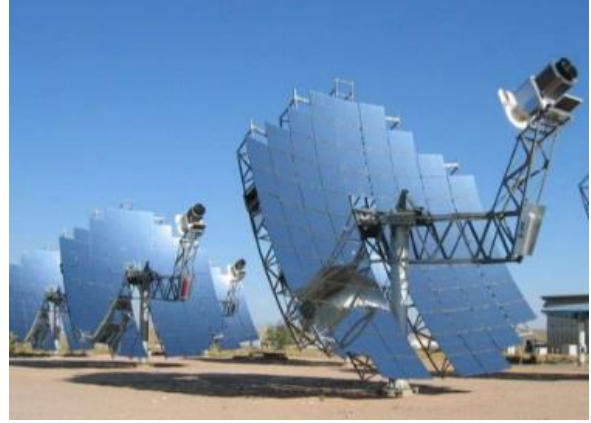
Figure 1. Stirling motorized parabolic calix system

A calix focuses solar radiation to receiver. System follows sun. Heat which is gathered is used by a heat motor directly on receiver. There are application with the purpose of small-sized individual used or larger plant. Stirling motorized parabolic calix system applications are seen on Figure 3 (Cengiz at al. 2015:8; Cengiz at al. 2015:300).