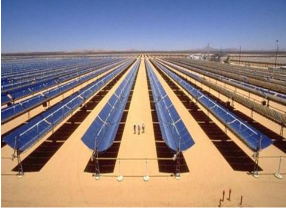
Figure 1. Parabolic trough system application

Trough designs can work with thermal storage as making electric production possible in a few hour at nights. Available all parabolic trough plants are hybrid plants. Hybrid plants use fossil fuels in order to meet the deficit in the case of low solar radiation. Typically, a natural gas-fired heat or gas stream heater is used, at the same time, it can be integrated in current coal-burned plants (Norm Energy 2014:04.04.2015). Parabolic trough system application is indicated on Figure 1.