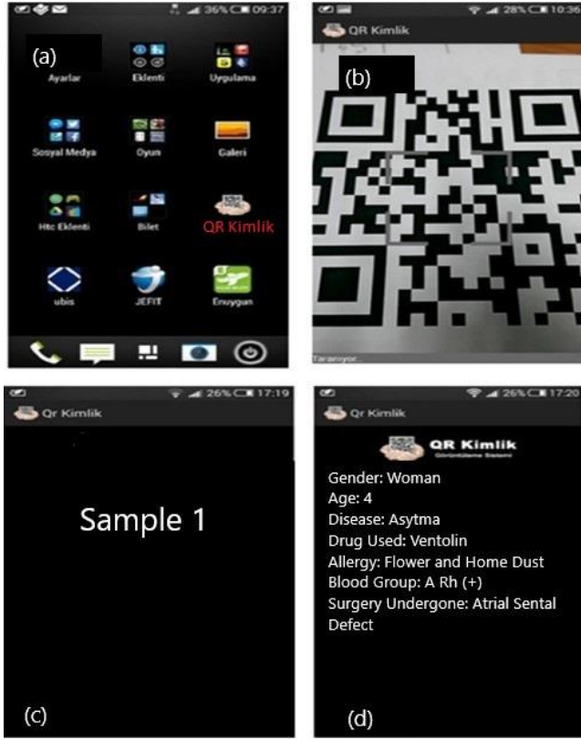
Figure 2. (a) QR ID web application, (b) QR code generated, (c) Person identification and (d) Contact information