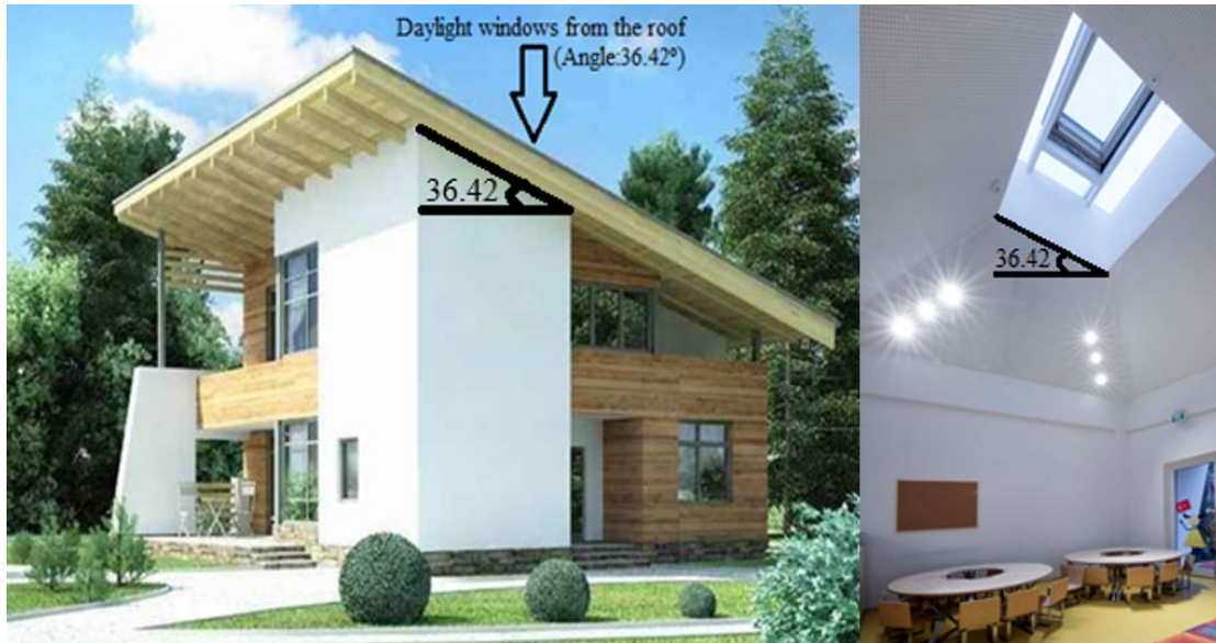
Figure 4. One-way roof.