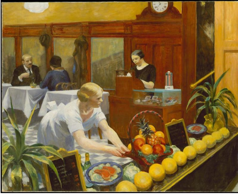
Figure 5. Edward Hopper, Tables for Ladies , oil on canvas, 1930, The Metropolitan Museum of Art, New York, United States