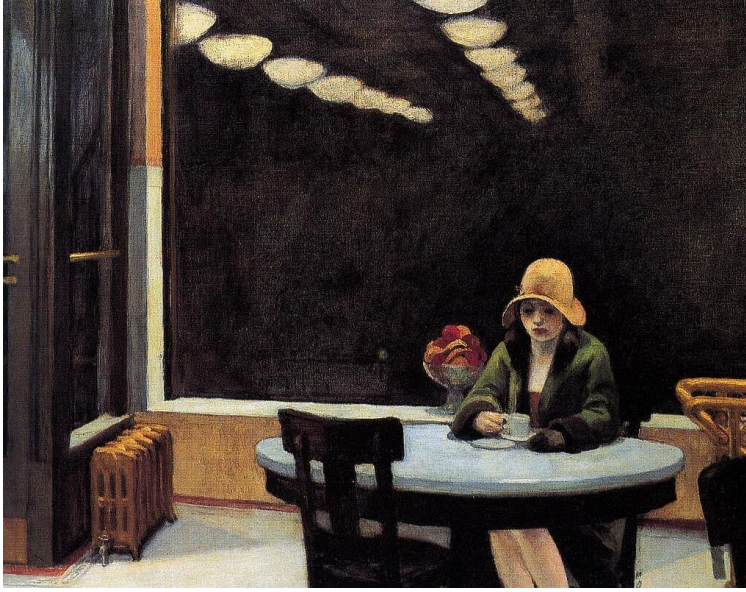
Figure 4. Edward Hopper, Automat , oil on canvas, 1927, Des Moines Art Center, Des Moines, Iowa, United States (Ufuk Çetin's personal archive, New York, 2000)

In Hopper's Tables for Ladies , (Figure 5) a server inclines forward to alter the clearly painted fixings at the window as a couple sits discreetly inside the luxuriously framed and appropriately lit inside. A clerk mindfully tends to big business at her sign in. Despite the fact that they seem tired and isolates, those two women protect presents recently needed for lady city occupants out of entryways the home. The composition's distinguish implies a new social development where foundations promoted "tables for ladies" as an approach to invite their recently portable woman customers, who, whenever seen eating alone in open once in the past, were thought to be prostitute.