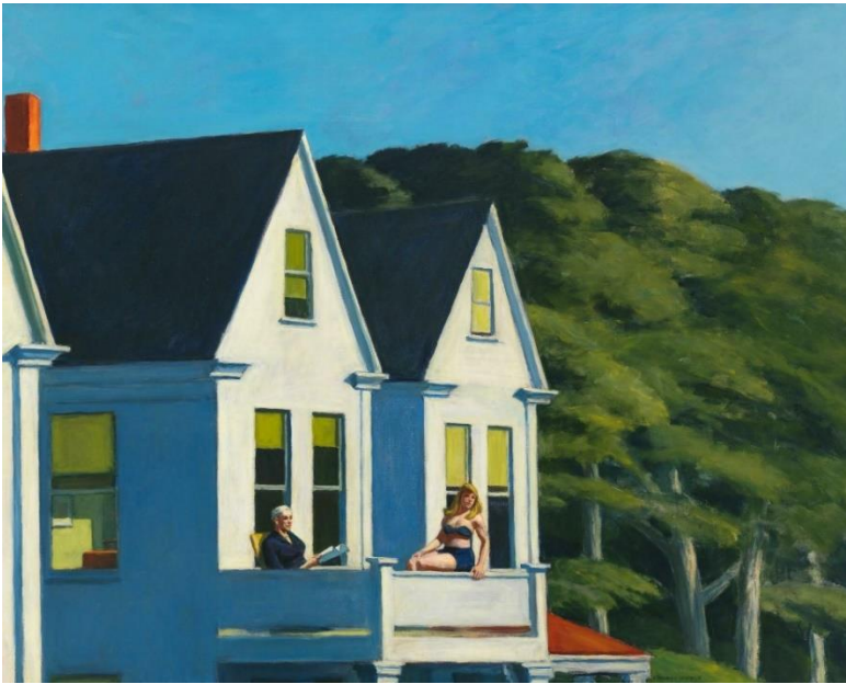
Figure 2. Edward Hopper, Second Story Sunlight, oil on canvas, 1960 Whitney Museum of American Art, New York City, United States