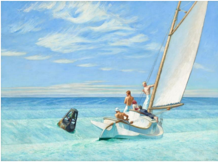
Figure 1. Edward Hopper, Ground Swell, oil on canvas, 1939, Corcoran Collection (Museum Purchase, William A. Clark Fund), National Gallery of Art, Washington, United States

In his painting “Ground Swell” (Figure 1) Hopper portrays a sailing boat dealing with four youngsters and a young lady directing a developing swell. Moreover, the craftsman made a few investigations for boats via as a kid experiencing childhood times in Nyack. Furthermore, his enthusiasm about sea and nautical points is alluded to the term of his oeuvre. In any case, likewise with large numbers of his paintings, This depict goes pleasantly becomes one of his past works its job as seascape. Despite what is by all accounts a sunny morning, the dull type of the chime float represents approaching destruction as does the boat’s emotional plunge to a just about 45 confirmation point. This painting changed into delivered in Hopper’s studio in during August and September in 1939 Cape Cod. There is a couple of idea that it emblematically addresses the deficiency of guiltlessness inside the essence of a questionable, unfavorable future.