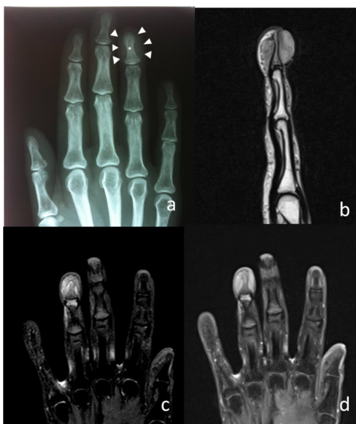
Figure 1 (a) AP radiograph. Medullary bone sclerosis, soft tissue swelling of distal phalanx of fourth finger. (b) Sagittal T2-weighted MR image. The medullary bone and soft tissue mass are hyperintense. (c) Coronal fat-saturated T2-weighted image also shows the lesion as hyperintense. (d) Contrast enhanced fat saturated T1 weighted axial plane image shows contrast enhancement of the soft tissue component of the lesion (asterisks).

heterogenous, rounded, soft tissue mass measuring 20 × 15 mm surrounding the volar and dorsal aspects of the right fourth distal phalanx. The lesion demonstrated hyperintense signal on T2-weighted and fat-saturated T2-weighted images (Figure 1b, c). Contrast-enhanced fat-saturated T1-weighted images showed significant contrast enhancement (Figure 1d). The bone cortex was not destroyed, but the medullary bone diameter was reduced compared with the other fingers. Based on the MRI findings, we made a presumptive diagnosis of a sarcomatous lesion.