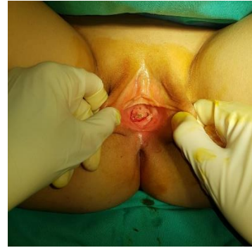
Figure 2. Postoperative photograph of the hymen.

Yazar Katkıları: Çalışma konsepti/Tasarımı: BÖ, ÇAA, CÇ; Veri toplama: BÖ, ÇAA, CÇ; Veri analizi ve yorumlama: BÖ, ÇAA, CÇ; Yazı taslağı: BÖ, ÇAA, CÇ; İçerğin eleştirel incelenmesi: BÖ, ÇAA, CÇ; Son onay ve sorumluluk: BÖ, ÇAA, CÇ; Teknik ve malzeme desteği: ÇAA, CÇ; Süpervizyon: ÇAA, CÇ; Fon sağlama (mevcut ise): yok.