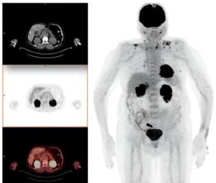
Figure 2. Fluorodeoxyglucose positron emission tomography/computed tomography image of the patient at diagnosis.