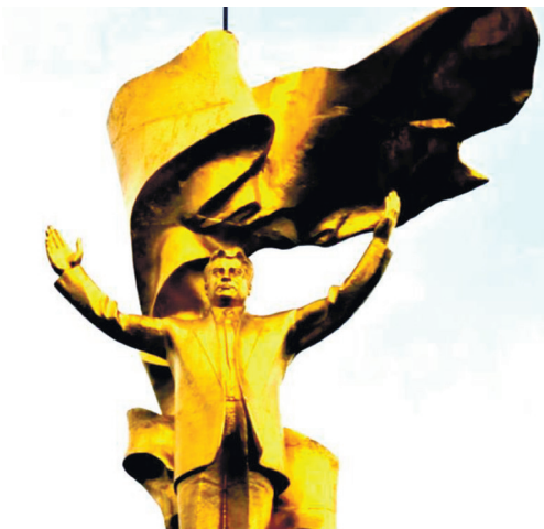
Figure 1. Golden Statue of Saparmurat Niyazov (Turkmenbashi) in Ashkhabad (Niyazov's 'Cult of Personality' takes physical form)

In 2001 a moral/religious guide written by Niyazov named Ruhnama (or Book of the Soul in Turkmen), became a compulsory reading in high schools and universities (Burke, 2014), turning into a local analogue of the Quran itself. Not long after the book's release, the knowledge of Ruhnama was also mandatory for professional certification in all institutions and organizations of Turkmenistan (Ria Novosti, 2006) 3 . Niyazov's presidency was indeed marked by numerous polemics and political setbacks for Turkmenistan. As an example, after an unsuccessful attempt to assassinate Niyazov in 2002, Turkmenistan witnessed an increasingly level of mass repressions and imprisonment.