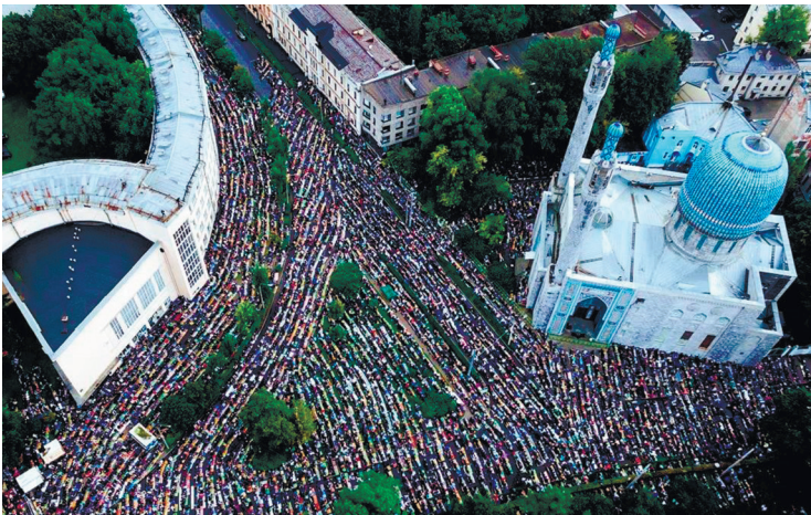
Figure 3. Aerial Photo of the Muslim Gathering at the Holyday Eid Al-Adha in St. Petersburg (Russia)

Communism provided the conditions for an Orthodox religious revitalization in Russia, with the former 'partially' occupying the place of State ideology (Huntington, 1996). According to survey data seemingly 70% of the current Russian population considers itself Orthodox, 12% are atheists and 6% are Muslims (Segrillo, 2015) 23 , thus placing Central Asians, in general, and Turkmen migrants, in particular, in the religious minority group. This reaffirmation of the Orthodox identity of Russia, albeit debatable in degree, is an element of contention with other sets of 'identities' within the Federation, such as the Muslims.