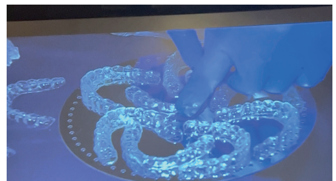
Figure 4: Graphy Shape Memory Clear Aligner curing stage

In order to enhance the predictability of clear aligner performance and treatment results, it is critical to understand the viscoelastic properties of creep and stress relaxation in addition to physical parameters such as static mechanical properties. Force degradation occurs when clear aligners are worn for extended periods of time and are frequently placed in the mouth. The clear aligners are made of viscoelastic polymers, which have properties halfway between elasticity and viscosity (Dupaix et al., 2005). As a result, the behaviour of clear aligners changes significantly over time under constant load (Fig. 4), (Fang et al., 2013).