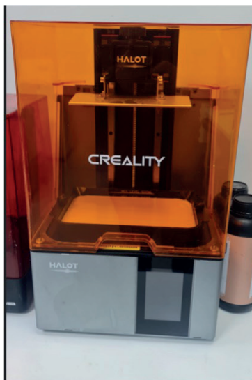
Figure 1: Creality Halot-One SLA Printer

The first commercially available 3D printing technology is stereolithography (SLA). Using highly cross-linked polymers, this manufacturing technique uses photoinduced polymerization to produce multilayer structures (Fig. 1), (Fan et al., 2020). This technology can be categorised into different groups based on the type of platform movement and laser movement. Regardless of these classifications, printing involves three main steps: exposure to light or laser, platform movement, and resin refilling. The typical example of additive manufacturing, which makes use of layer-by-layer modeling, is stereolithography. The SLA equipment completes the printed object under the direction of a 3D digitized model that serves as a template for the fabrication process. When resin is exposed to ultraviolet light, which causes the resin monomers to undergo free radical polymerization (FRP), the layers are joined from the bottom up. As each layer is polymerised, the resin platform descends by a distance equal to the thickness of one layer, building up the next layer until the 3D digital model is printed (Sakly et al., 2014; Jain et al., 2013; Lipson & Kurman 2013).