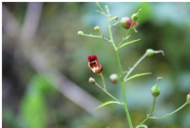
Fig 1. S. capillaris Boiss. & Bal.

Collected specimens: A8 Rize: Karayemiş village-Güneysu, 282 m, 11.05.2013, mixed forest, ME. Uzunhisarcıklı 2370, B. Bilgili & E. Doğan Güner (GAZİ); ibid, 26.06.2013, ME. Uzunhisarcıklı 2449 & E. Doğan Güner (GAZİ); İkizdere-İyidere, s.l., 11.05.2013, roadsides, ME. Uzunhisarcıklı 2371, B. Bilgili & E. Doğan Güner (GAZİ).