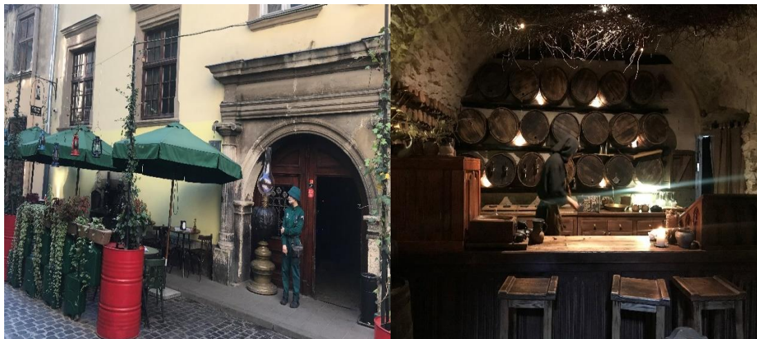
Figure 3. Gasova Lampa (Gaslamp) restaurant entrance and waiting staff (left), a staff member in Medieval age clothing at the 5th Dungeon restaurant (right). (Source: Taken by the author).