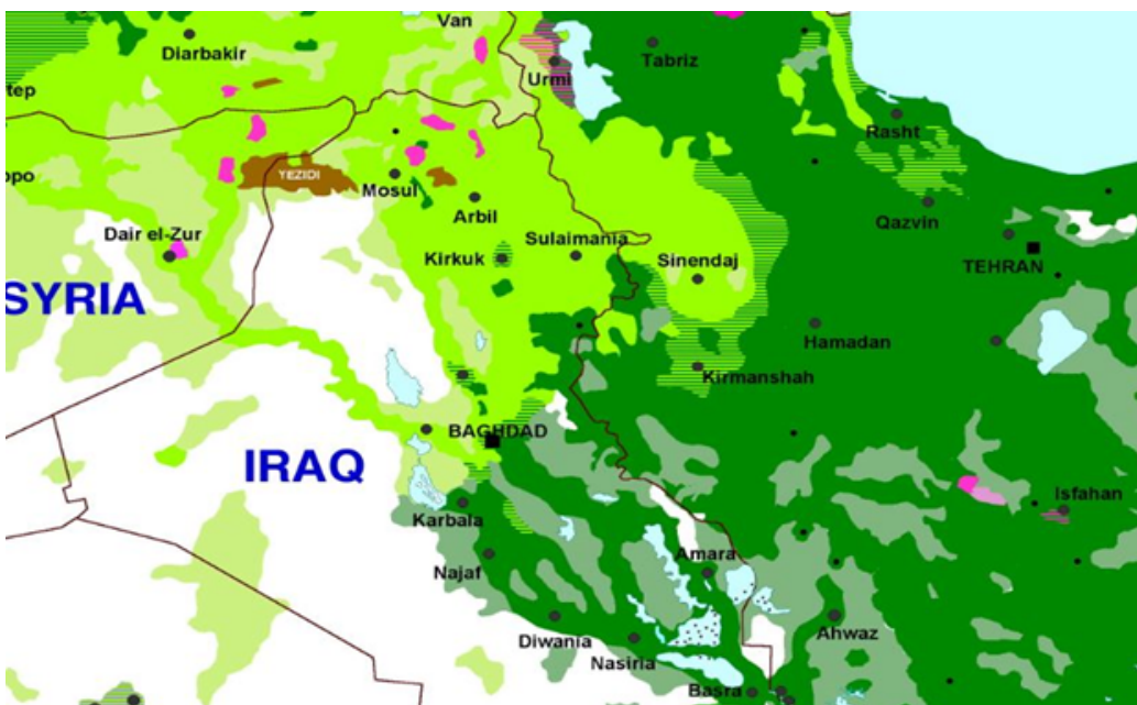
Map 2: Religion Distribution of the Region. Dark green refers to Shia, light green to Sunni and pink to Christian societies. (Source: https://thegulfblog.com/tag/sunni-shia-middle-east-map/ ).

"Kurdish nationalism as if an independent Kurdish government founded in Northern Iraq, both Turkey and Iran (naturally Central Iraq Government) will never agree on allowing such attempts."