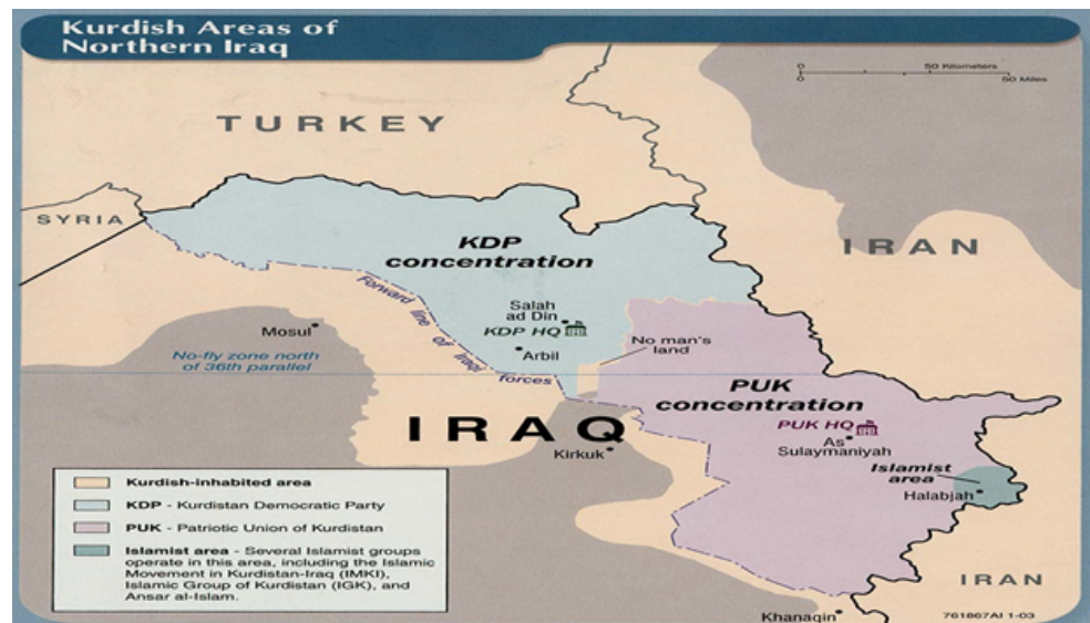
Map 1: Kurdish areas of Northern Iraq..

"Turkey let KRG to export around 500 mb/d oil from Turkish Ceyhan port, which is the vital step for KRG's presence."