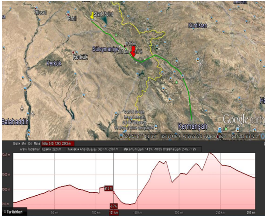
Map 4: Northern Iraq to Iran Pipeline.