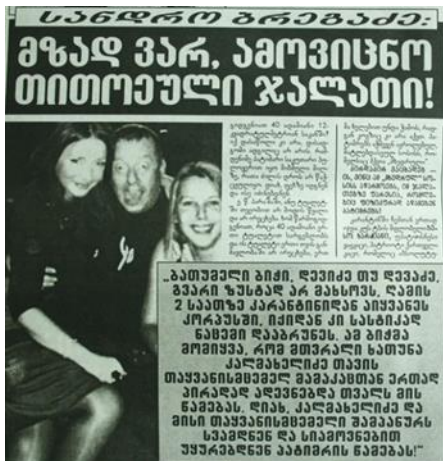
“Asaval-dasavali”, 24-30 September, 2012

The weekly newspaper “Asaval-dasavali” is only one which covers “prison scandal” with the personal photo.