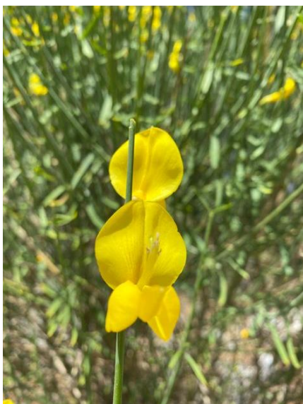
Figure 1. Flower of SJ plant.