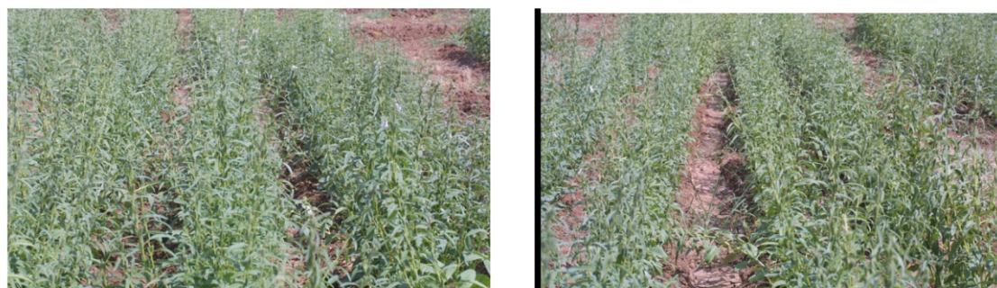
Figure 2. Experimental area