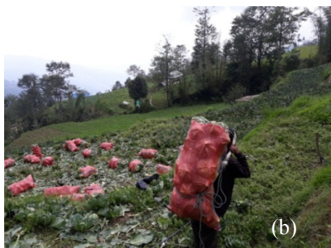
Figure 2. (a) Harvesting of cabbage and packaging; (b) Transportation upto main road on back by farmers