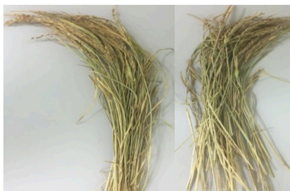
Figure 1. Paddy stalk with panicles

The Karacadag white paddy variety (Figure 1) was used for tests. Paddy stems were collected at harvesting season from a commercial farm in Diyarbakır province in 2018, Turkey. The whole paddy plants average 0.82 m in height and were cut manually prior to the cutting testes at height of 25 cm above the soil level. After the paddy stem was harvested, it was covered and transported to University of Dicle, Department of Agricultural Machinery and Technologies Engineering Research Laboratory for tests. The tests samples stored at a temperature of 4 °C for one month until start to shearing tests. Selected some properties of paddy are seen in Table 1.