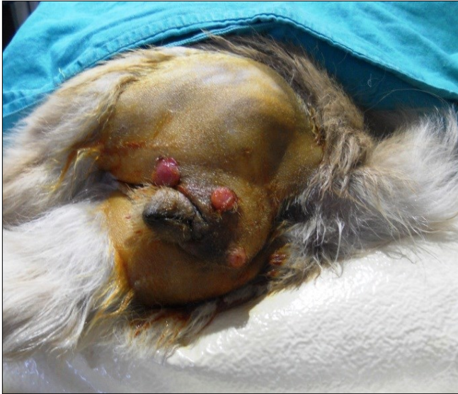
Figure 1. View of nodules in perianal region.

diameters were 1.8, 1.5, and 1.2 cm. In cross section, the nodules were whitish-yellow in colour, of solid consistency, and characterized by thickening of the skin. The dog had not previously undergone surgical removal of tissue.