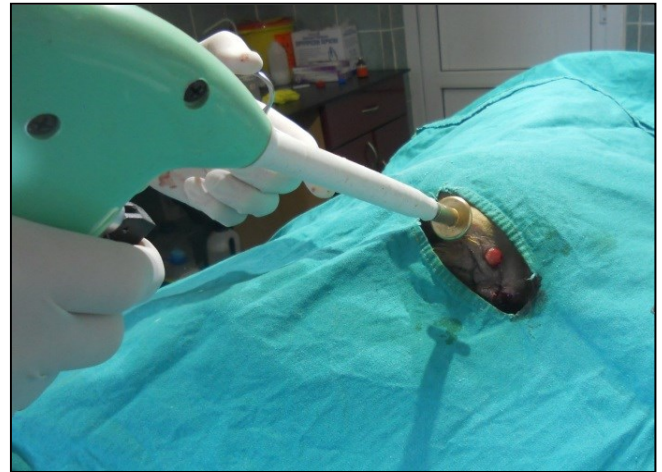
Figure 3. Application of cryoprobe to mass.

A probe with cytotherapeutic zones of 2 cm diameter was used in the study. The probe delivered liquid nitrogen, which did not come into contact with the ablated tissue. Being closed to liquid nitrogen flow allows for the thawing effect in the frozen cavity. Three cycles of freezing and thawing were induced, with the skin area being observed throughout (Figure 3).