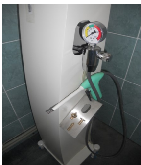
Figure 2. View of criosurgery equipment.

The dog was premedicated with xylazine HCl (2 mg kg -1 , IM, Alfazin®, Turkey). The probe-based cryosurgical system (Üzümcü, Istanbul, Turkey) was used for cryoablation using a local anesthetic (Industrial Ave, Molendinar, Australia) as the interface for uniform freezing. This system was comprised of a tube of liquid nitrogen (-195 °C) and a probe (Figure 2).