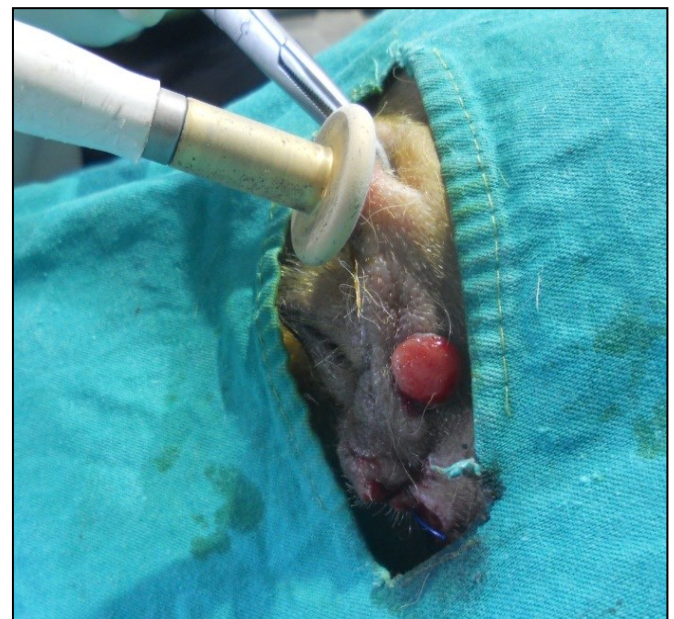
Figure 4. View of the ice formation of the whole tumor.

Freezing time was about 30 to 60 seconds. This was accomplished by ice creation over the whole tumor with at minimum 5-mm of independent margins (Figure 4). Technical achievement was noted as an elongation of the ice ball going further the tumor margin and post-ablation views indicating no contrast rise in the field of the original tumor 6 months following the primary procedure. Postoperatively, the patient was administered intravenous antibiotics for 72 hr. No visible tumor was defined by day 45, and no recurrence was observed till 2 years.