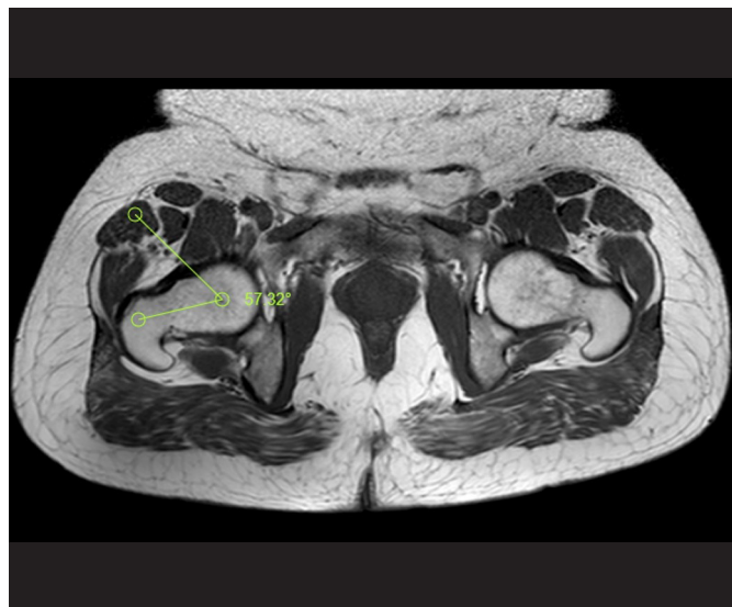
Figure 1. 43-year-old male, alpha angle measurement.

the angle between the perpendicular line drawn from the center of the femoral head to the acetabulum and the line connecting the outermost point of the acetabulum (Figure 2). Measurements were compared statistically between the groups. A value of p < 0.05 was considered statistically significant.