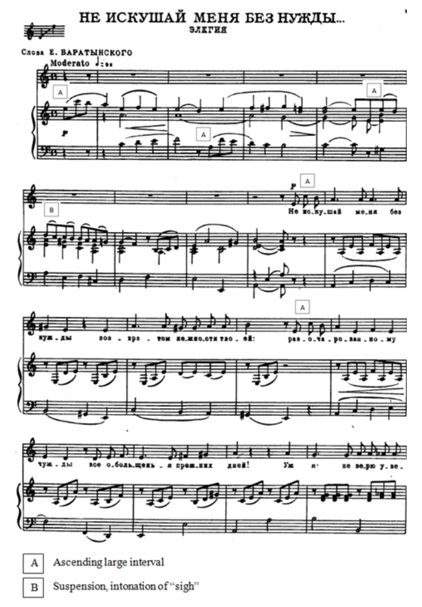
Notes 4. Displaying of the notes of "Reassurance" by M. Glinka (Bars 1-18) with the letter designation of folk elements (designed in Microsoft Word program by the researchers)

In the second stanza, on the one hand, the deviation in Do-major brightens the expression; on the other hand, tension grows in the harmony (diminished VII°6), in the melody, there is a great reliance on the declamation (Picture 5). This section is emotionally opposed to the first one. The calm, static mood is replaced by an active dynamic declamation: the range of melody movement increases and chromatisms appear in it. Accelerated pulsations of the accompaniment, colourful changes of keys and bright turns of harmonies give the music either excitement, passion, or a feeling of confused, uneven breathing. This increase in expression is confirmed by an intonational chromaticity. Certain emotional upsurge followed by a wave of decline interrupted by deceptive cadence leads to a perfect cadence, ending in a grupetto. The romance ends with a short piano postlude based on the introduction pattern. It gives the whole work completeness and balances the form.