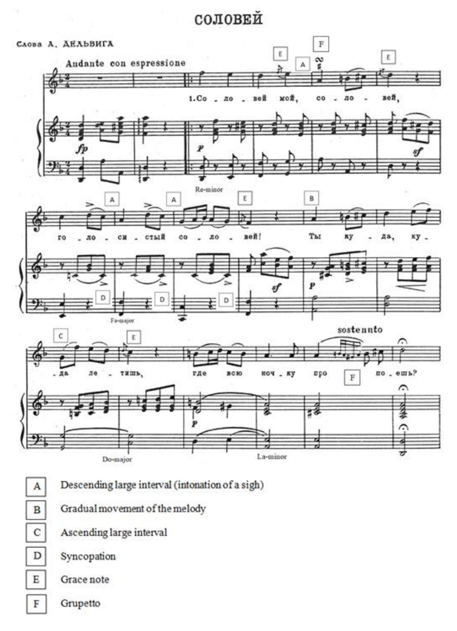
Notes 1. Displaying of the notes of "The Nightingale" by A.Alyabiev (Bars 1-18) with the letter designation of folk elements (designed in Microsoft Word program by the researchers)

The piano accompaniment and harmonisation are done according to the classical tradition; the base tone in the left hand's part is followed by the harmonic accord, broken chord, or arpeggiated accompaniment for the right hand. Most Russian romances of that time are based on the harmonisation and structure specific to the classical tradition. In the second part of the romance, with a change of tempo to Allegro vivace , with the swirling piano accompaniment and its syncopated rhythm, the influence of the gypsy song, which was widely popular in the 1820s, seems to be manifested. Gypsy style in tempo, dynamism, rhythm, and texture of the composition prevail as the work approaches the end. Simple at first glance, the piano accompaniment repeats the main theme echoing the vocal melody as if a nightingale replies to a girl. The image of the night singer includes various melismatic decorations (grace notes, grupettos) in the melody, as well as chromatic IV in the piano part (Notes 2).