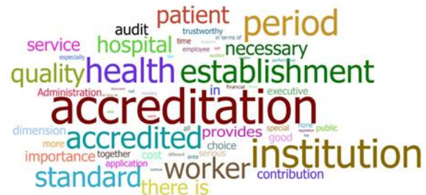
Figure 1. Word cloud

The word cloud created for the concepts expressed in the interviews with the HAAs within the scope of the study is given in Figure 1. Accordingly, during the interviews, the most frequently used words are accreditation (467), institution (319), process (303), health (243), organization (229), accredited (172), employee (154), standard (153), quality (114), patient (99), hospital (81), available (81), necessary (80), service (80), provides (75).