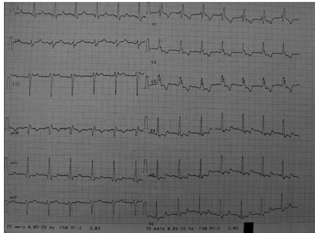
Figure 1: Electrocardiogram showed RBBB pattern and down slope ST segment depressions in leads DI, aVL and V1-6.

Echocardiography which was performed after relief of patient showed grade 1 diastolic dysfunction. Left