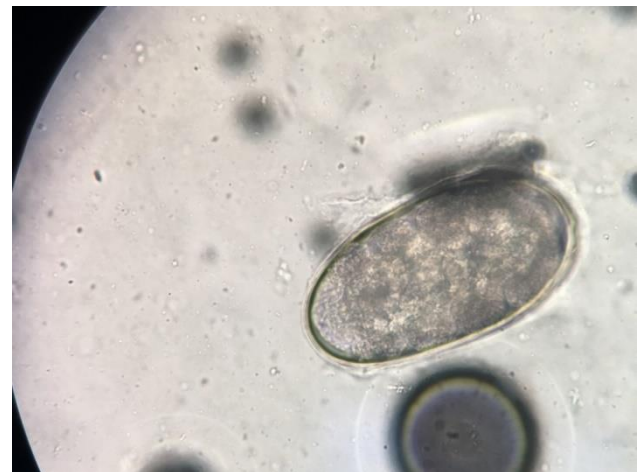
Figure 3. Mite Eggs (20X)

With large amounts of mites identified on the body, the patient was asked to bring dust samples from 4 different areas of her house. The patient was told to place all dust obtained in a closed large container after vacuuming the living room, bedroom, hall and kitchen with an electric vacuum cleaner, and to bring it to the parasitology laboratory immediately.