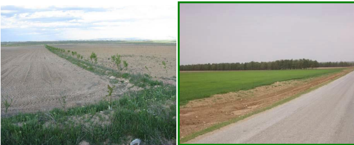
Fig 2 The orchards at around the wheat field