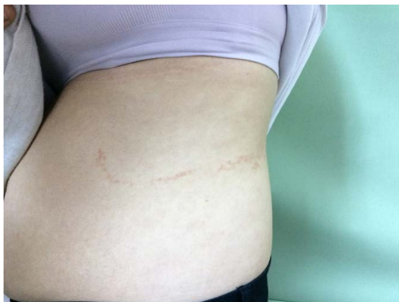
Figure 1. Asymptomatic linear erythematous violaceous papular lesions on her left abdominal area

area, vacuolar degeneration of the basal membrane, perivascular and lichenoid lymphocytic infiltration (Figure 2). The histopathological diagnosis was lichen striatus.