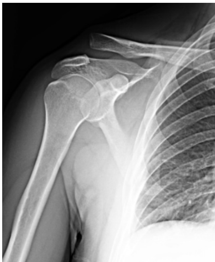
Fig. 1. X-ray image of acromioclavicular joint dislocation.

In our study, we examined 21 patients who applied to our clinic with the complaint of post-traumatic shoulder pain between November 2016 and February 2022 and treated with hook plate after AC joint dislocation was detected. Diagnosis made by direct radiography and MRI was used for Rockwood classification (Fig. 1). The patients included in this study were acute injuries of type 3-5 according to the Rockwood classification, older than 18 years of age, had no history of shoulder trauma or surgery to the shoulder region, and were not accompanied by a clavicle fracture.