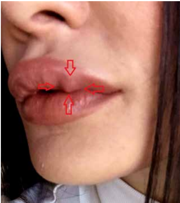
Figure 4. Subacute abscess formation after hyaluronic acid filler application to upper lip (39 year-old female patient).

infraorbital edema 1.62%, granuloma 2.43%, ecchymoses 2.43%, and abscesses 0.81%.