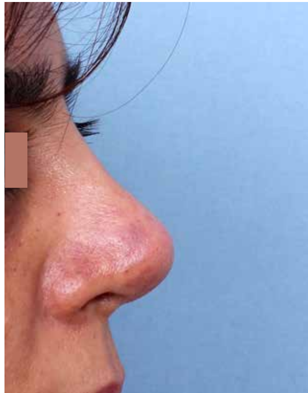
Figure 2. Livedo reticularis on nasal tip after hyaluronic acid filler application to nasal tip (47 year-old female patient).

Infraorbital edema in two patients and granulomas in three patients were completely treated in 7 to 12 days with the use of hyaluronidase (20 to 30 U, single application).