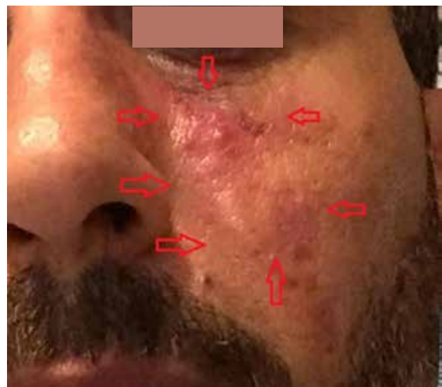
Figure 3. Acute cellulitic infection after hyaluronic acid filler application to nasolabial fold (38 year-old male patient).

Among all patients, only 12 patients experienced HA filler-related complications, corresponding to 9.75% of all patients receiving HA filler application. The incidence of each type of complication is as follows: vascular complications 1.62%, cellulitic infections 1.62%,