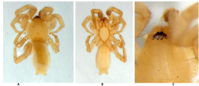
Figure 2. Cryptodrassus creticus Chatzaki, 2002: Habitus (male) A- dorsal, B- ventral, C- ocular area

we did not otherwise find it during our collecting trips. The characteristic features of our C. creticus samples are not different from the European specimens.