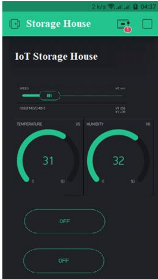
Figure 3. System dashboard design.

temperature sensors are sensitive devices, which were incorporated into smart system to monitor the temperature and humidity level inside the storage system. The graphical user interface (GUI) used in selecting commands in this system is presented in Figure 3. On the System dashboard is the Switch “ON” and “OFF” buttons, which allows the user to switch on the heater and fan from anywhere, provided there is internet network.