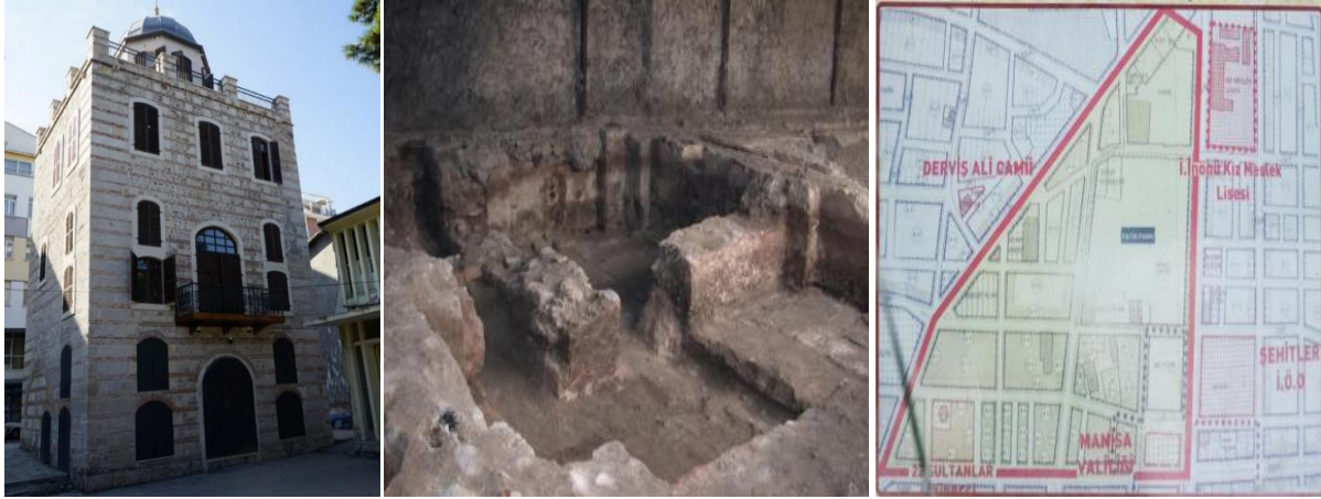
Figure 2 Fatih Tower and bath remains

monumental structures that reflect the past location of Saray-ı Amire (Gevorgyan etl al.; 2023).