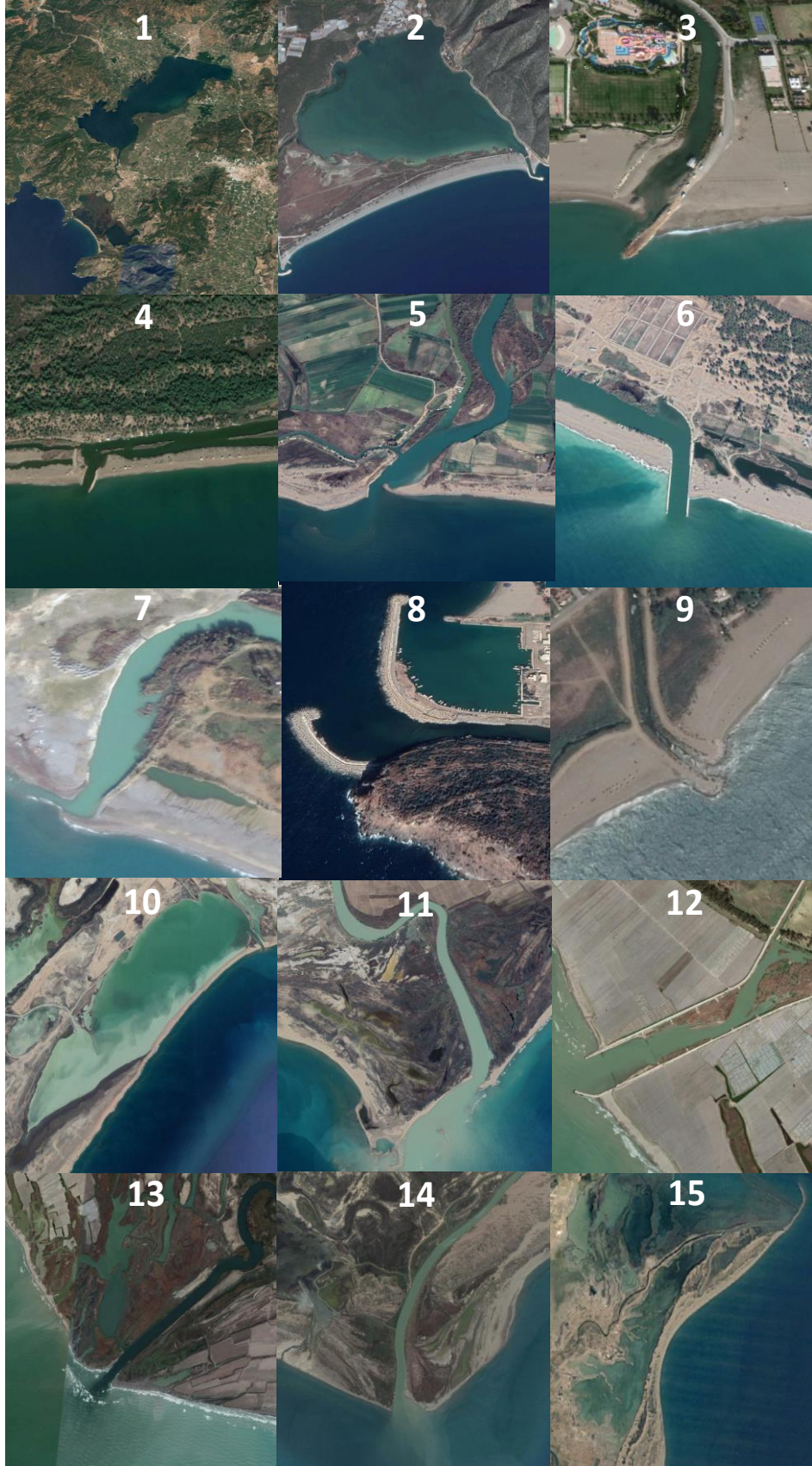
Figure 2. Google Earth photographs of localities (1-Köyceğiz lagoon lake; 2- Beymelek lagoon lake; 3- Kopak creek estuary; 4- Beşgöz creek estuary; 5- Köprüçay river estuary; 6- Manavgat river estuary; 7- Karpuzçay creek estuary; 8- Hacımusa creek estuary; 9- Sultansuyu creek estuary; 10- Paradeniz lagoon lake; 11- Göksu river estuary; 12- Berdan river estuary; 13- Seyhan river estuary; 14- Ceyhan river estuary; 15- Yelkoma lagoon lake)