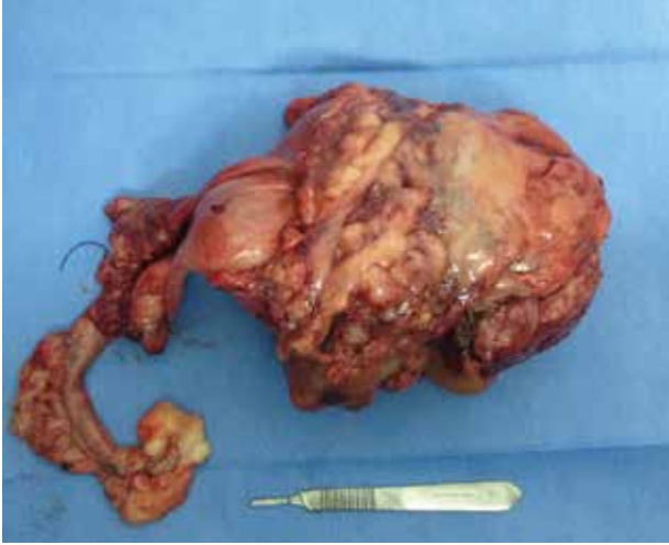
Figure 3. Macroscopic appearance of genital organs and ovarian mass.

abdominal organs, tight adhesions to the liver, omentum and bladder were noted.