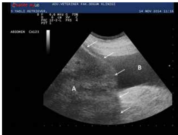
Figure 1. Ultrasonographic image of the mass (A- arrows) and bladder (B).

At clinical evaluation, a large and firm mass was detected in abdominal palpation. The patient had dysuria and constipation problems that lasted four days. No vaginal discharge was observed in the vaginal inspection and the external genitalia appeared normal. The patient's body temperature was 37.0 °C.