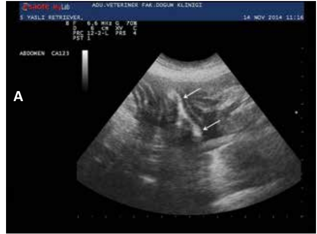
Figure 2. Ultrasonographic image of mild ascites and bowels (arrows). Şekil 2. Orta düzeydeki ascites ve barsakların ultrasonografik görüntüsü (oklar).

isoechoic to hyperechoic mass located from the bladder to the liver (Figure 1). In addition, mild ascites was noted (Figure 2).