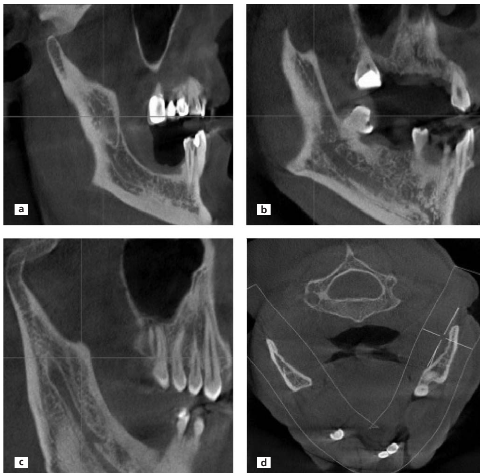
Figure 3. (a) Sagittal view of bifid retromolar canal. (b) Sagittal view of the third molar type dental canal. (c) Sagittal view of forward canal. (d) Axial view of the buccolingual canal.

( Figure 3 ). Forward canals were subdivided into with confluence and without confluence. Dental canals were subdivided into first, second and third molar canals according to the region of separation from the main canal. Additionally,