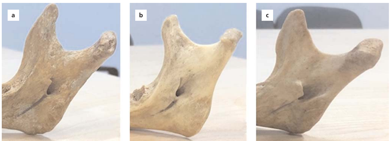
Figure 2. Different types of lingula; (a) triangular, (b) nodular, (c) truncated.

The classification of the lingula shapes was described in numbers and percentages. The data regarding all distances