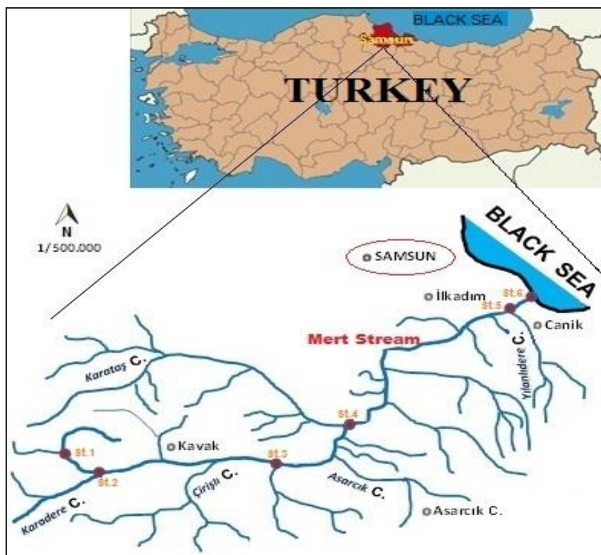
Figure 1. Location and sampling stations of Mert Stream

6th station (41°16'43" N, 36°21'06" E) is at the stream mouth part in Canik district where the Mert stream flows into the Black Sea. This site is also located on the Samsun-Ordu highway next to the shopping center of Piazza.