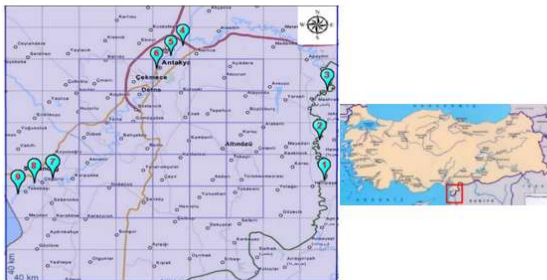
Figure 2. Distrubition patterns of E. crassipes on Asi River