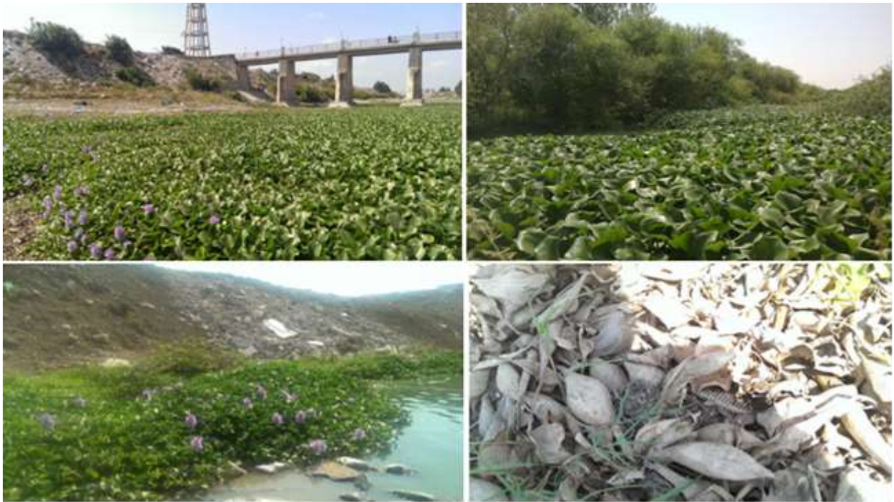
Figure 3. Populations of Eichhornia crassipes on Asi River, Hatay

After monitoring 9 sites in following regions: Hacıpaşa, Bohşin, Demirköprü, Güzelburç, Küçükalyan, Antakya, Sutaşı, Tekebaşı, and Meydan along Asi River; we found that E. crassipes was represented with three main populations (Reyhanlı, Antakya, Samandağ) (Figure 2). It was observed that first population was located immediately after Syrian border near Hacıpaşa and after that other populations were seen along the river until entering the Mediterranean Sea. There were also numerous small plant colonies between these main populations (Figure 3).