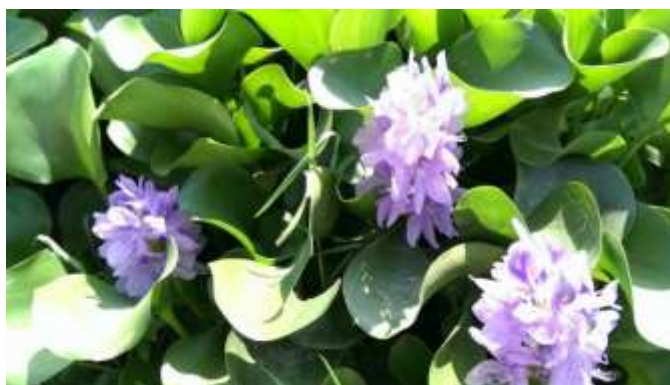
Figure 1. General view of Eichhornia crassipes (Pontederiaceae)

This invasive alien plant was recently seen in Asi River (Orontes), Turkey, and included to the list of quarantine pests of Turkey in 2010 (Anonymous, 2010). This species seems to create populations at riverbed of Asi River in the last 3 years (Figure 1). Although this species is assumed to be transited to Turkey from Syria, there is no accurate and clear information about it. On the other hand, distribution patterns and genetic variation of its population need to be clarified. Moreover, because of high reproducibility and adaptability to various environment, this species rapidly occupies new habitats and causes potential risk to ecosystem. Therefore, knowledge on its population area, size and density as well as genetic structure will provide valuable data about the status of this species in Asi River, Turkey.